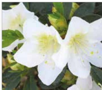
Azalea 'White Lace' White Lace is a heat-tolerant southern indica hybrid with trumpet shaped white flowers and light green speckled throats. Blooms early-to-mid spring and grows 4-6' high and wide.