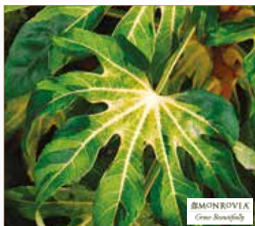
Camouflage Japanese Aralia

A perennial with two-toned foliage and huge clusters of vivid scarlet-orange blooms that are adored by hummingbirds. Compact and clump forming, it thrives in the landscape or patio containers. Stunning in cut-flower arrangements. Grown by Horticultural Craftsmen.