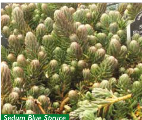
Sedum Blue Spruce

A low growing plant with purplish bronze leaves that bear dark-red blooms on trailing stems. Spreads to 2ft +. In summer, pink flowers appear in dense clusters at ends of 4-5 inch stems. Attracts butterflies and beneficials.