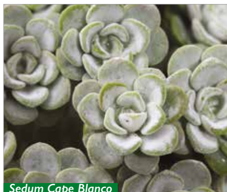
Sedum Cape Blanco

A spreading, creeping, drought-tolerant plant. Features narrow light blue-gray leaves that look like needles, closely set on stems. Yellow flowers in summer. Very vigorous.