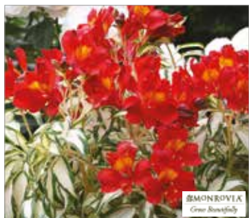
Alstroemeria Rock & Roll

Upright stems feature wide, liquid-amber shaped green leaves with a creamy-white, wide border. The leaves brighten up darker landscapes. Non-invasive roots. Stems need to be staked or supported. Can be grown indoors.