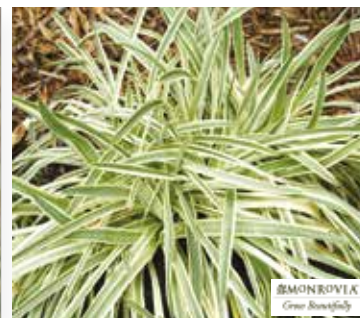
Liriope spicata 'Silver Dragon'

Tiny evergreen leaves with broadly variegated creamy-white edges. Sturdy, arching branches bear clusters of tiny, intensely scented flowers, exuding a white chocolate-like fragrance. This is an outstanding small tree, effortless espalier, or container specimen. Grown by Horticultural Craftsmen.