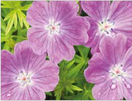
'Vision Violet' Geranium

Need a hardy, low-maintenance, flowering plant that can be planted almost anywhere? Try true geraniums; they'll grow happily in rock gardens, perennial borders, containers, and as groundcovers. Compact and able to spread quickly, true geraniums bloom over a long period of time, bearing show-stopping flowers and foliage. They do prefer some shade, especially in the East Bay. Grow in moist, well-drained soil.