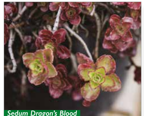
Sedum Dragon's Blood

This South African ice plant relative features trailing stems to 2 ft. long, profusely set with inch-wide, heart-shaped or oval, fleshy bright green leaves. Its bright red flowers bloom in spring and summer.