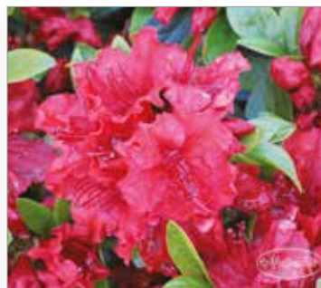
Azalea 'Girard Hot Shot' Girard Hot Shot is an evergreen shrub known for its relatively large flowers and compact growth habit. In mid-spring clusters of orange-red flowers appear. Reaches 2-4' high by 3-5' wide.