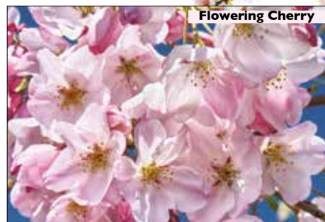
Prunus 'Akebono' This deciduous tree with a spreading crown reaches 15-20' high and wide. In spring, branches are covered in carpets of double pinkish-white flowers, and in fall, foliage turns a bright golden-yellow.