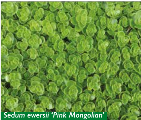
Sedum ewersii 'Pink Mongolian'

Succulents are garden workhorses, performing especially well as groundcovers, in rock gardens, and for draping over walls and containers. Soft and easily crushed, most succulents will not take kindly to foot traffic, but they are otherwise tough, low-maintenance plants that are interesting and fun to use throughout the garden. Once established, many will naturalize and not require much attention except for occasional summer watering. Sounds good to us!