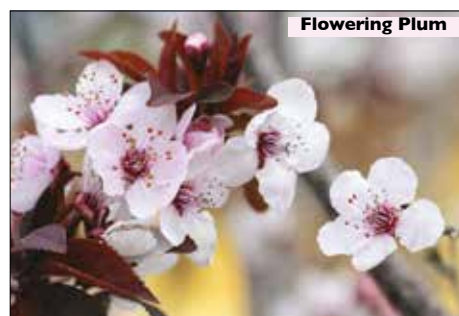
Prunus 'Thundercloud' Features unique, deep purple foliage. Grows to 20' high and wide. Branches are covered in showy pink-white blooms. Bears small red fruit that are great for jam.