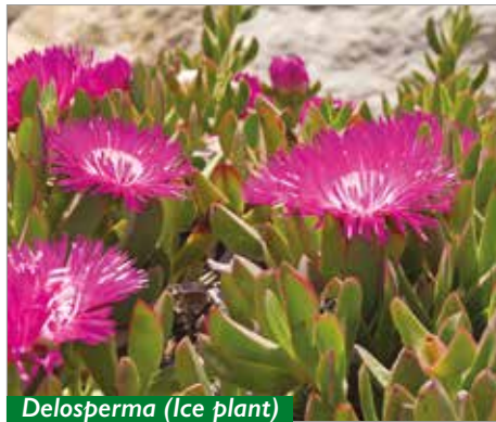
Delosperma (Ice plant)

Features upright stems clothed in gray-green leaves. Dense dome-shaped flower clusters appear atop stems. Their long lasting floral display begins late summer to fall; blossoms open purplish pink, age to brownish maroon.