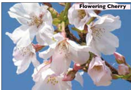
Prunus 'Yoshino' A deciduous flowering cherry that produces clusters of lightly fragrant double light-pink flowers each spring. Leaves turn yellow in fall. Its small reddish-black fruit is a good bird food source. Tree shape features an oval crown.

The delicate, blossom-adorned branches of ornamental flowering cherries and plums are synonymous with the welcome arrival of spring. These trees, with their profusion of bright, glossy leaves, are a Bay Area landscape stand-by; they require fast draining, well-aerated soil. Available at all Sloat Garden Center locations this spring.