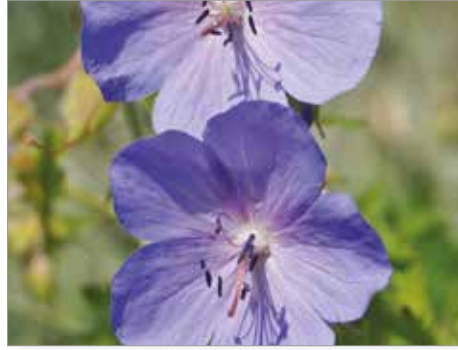
'Johnson's Blue' Geranium

This robust ground cover produces masses of large magenta flowers with purple veins in spring through late summer. Lends a soft edge accent to perennial areas, container plantings and rock gardens.