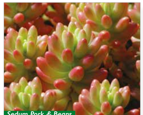
Sedum Pork & Beans

This CA native has bright blue-gray leaves packed into rosettes on short trailing stems. Light yellow clusters of flowers bloom in spring & summer. Very drought-tolerant.