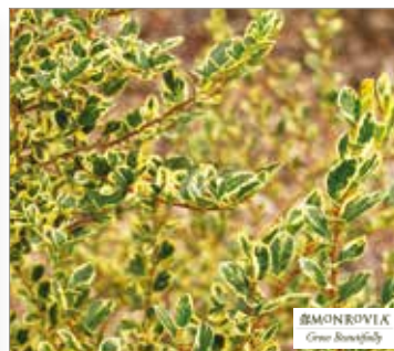
Variegated Box Leaf Azara

This handsome shrub illuminates the dappled shade garden with its colorful blend of yellow, lime and deep-green, highly textured foliage. Stays evergreen and very often will bloom from fall to winter, producing showy panicles of white flower clusters. Grown by Horticultural Craftsmen.