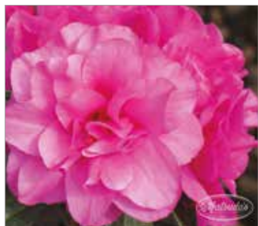
Azalea 'Happy Days' Happy Days is a prolific, blooming, evergreen shrub with large clusters of double violet flowers that appear in mid-spring. Grows 3-5' tall by 4-6' wide.