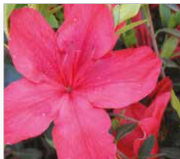
Azalea 'Orange Delight' This heat-tolerant southern indica hybrid bears trumpet shaped orange-red flowers with red speckled throats from early-to-mid spring. Grows 3-4' high and wide.