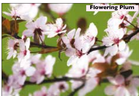
Prunus 'Krauter Vesuvius' This beautiful deciduous tree with deep purple foliage grows 20' tall by 15' wide. Features showy pink flowers each spring, but bears little-to-no fruit.