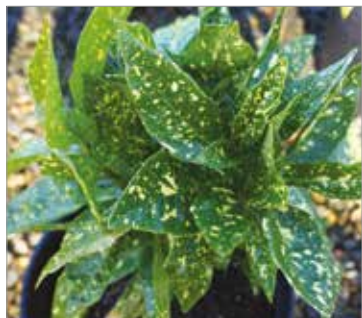
Aucuba jap. 'Variegata'

Variegation describes the striping, edging or marking that stands out from a plant's primary leaf color. We're focusing on variegated plants this month with eight specimens that will bring unique tones to your garden. Plant them to add a burst of color (and sometimes flowers) to your landscape or container.