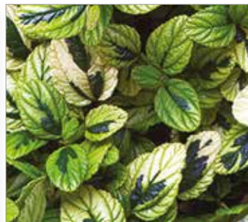
Ceanothus 'Diamond Heights'

This colorful evergreen shrub forms a compact mound of cream-and-green variegated foliage about 2-3' high and wide. In spring, brilliant magenta trumpet-shaped flowers bloom. Good for containers / small spaces. Attracts butterflies!