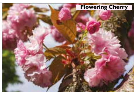
Prunus 'Kwanzan' In spring, branches are covered in clusters of deep-pink double flowers. Fall features golden-yellow foliage. This is a stunning deciduous tree with an upright vase-shaped crown.