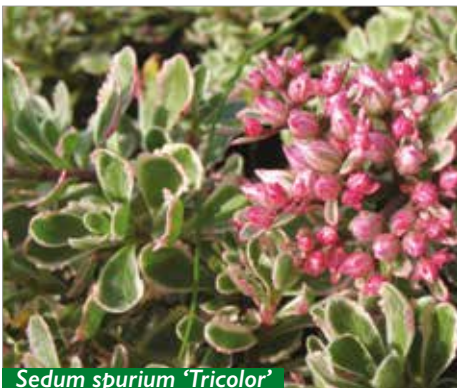
Sedum spurium 'Tricolor'

Leaves are covered with glistening dots that look like tiny ice crystals; features typical ice plant flowers with many narrow leaves. Blooms in late-spring or early winter and endures poor soil. The flowers form sheets of blooms that attract bees.