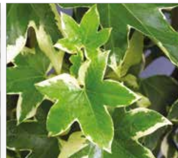
Fatsyhedera 'Angyo Star'

This drought-tolerant evergreen shrub forms a low mound of brilliant chartreuse-and-green foliage 1' tall by 5' wide. In spring, pale blue flowers bloom. Thrives with a little afternoon shade in hot climates. A wonderful container plant!