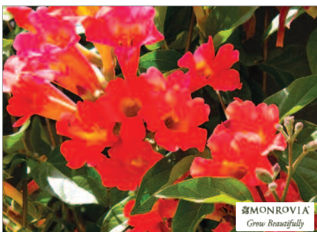
Scarlet Trumpet Vine Distictis buccinatoria

Excellent vine cover for fences, trellises, and arbors. Showy trumpet-shaped, orange-scarlet flowers. Semi-evergreen to deciduous in colder areas. Evergreen in warmer climates. Attracts the hummingbird clearwing moth.