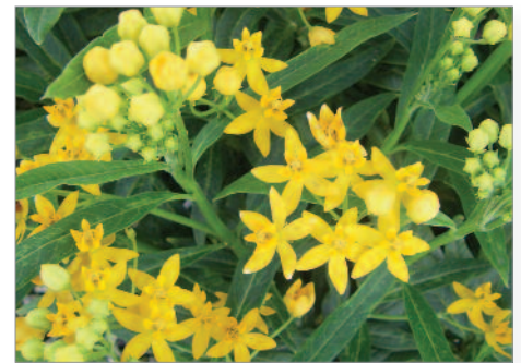
Asclepias 'Silky Gold'

Brownish green leaves provide a dark background for red flowers with yellow centers. In the language of flowers, this one means 'Let me go'. Which is what it does when the seed pods ripen and the seeds float off in the wind. Grows about 3-4' tall and is a great attractor for Monarch butterflies. Blooms all summer.