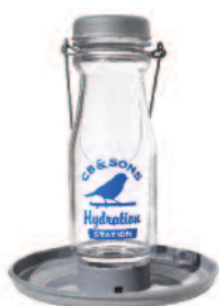
Hydration Station Waterer Holds 18 ounces Silver finish on cap and basin

Our new feeders are designed to attract more birds to your garden. Easy to clean and easy to fill. Twelve new styles with one touch openings! Here are three from the new line: