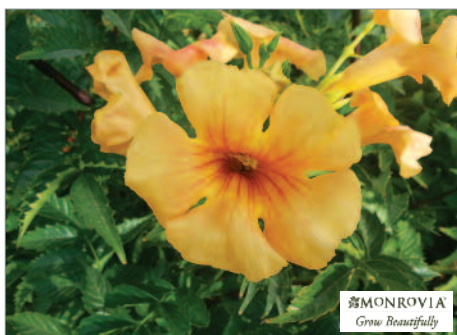
Sunrise Gold Trumpet Vine Campsis 'Sunrise Gold'

Trumpet vines are vigorous climbers that bear clusters of radiant blossoms shaped like flaring trumpets from mid-summer to fall. Loved by hummingbirds, each of our unique Trumpet Vines produce a different bloom time and fragrance, so you can enjoy them throughout the summer. Train Trumpet vines and Passiflora on a trellis or wall to showcase their foliage and showy flowers.