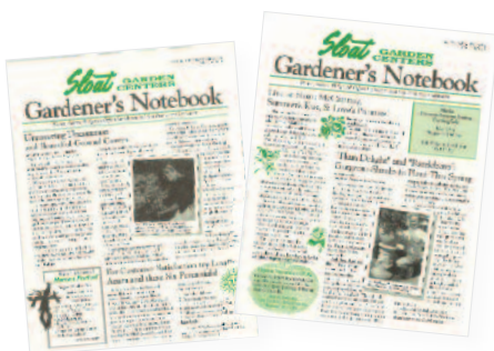
Our newsletter had humble beginnings...