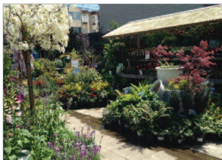
The 3rd Avenue store