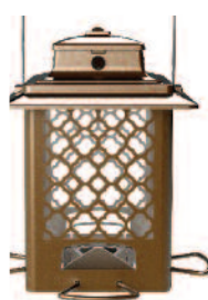
Metal Hopper • 3.6 pound capacity • Durable squirrel resistant metal hopper • One touch opening for easy filling • 4 large rounded ports to attract more birds

Did you know... Water attracts just as many birds as seed does.