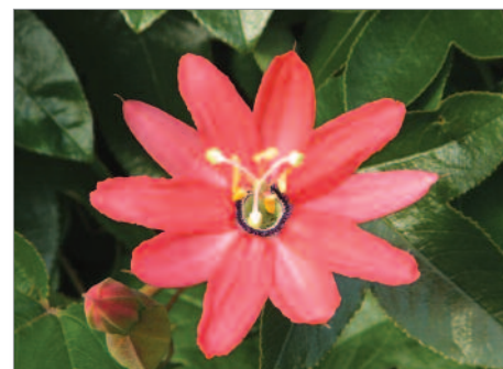
Coral Seas Passion Flower Passiflora jamesonii 'Coral Seas'

Evergreen vine with rapid growing woody branches. Glossy dark-green leaves are a lovely contrast to the light lavender, trumpet-like flowers over a long blooming period. Easily grown in sun or part shade.