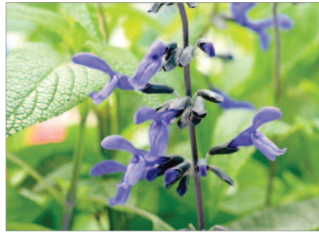
Salvia 'Black and Bloom'

Lavender Meerlo is one of the most heat, humidity, and WaterWise lavenders. These vigorous plants hold their beautifully variegated and highly fragrant foliage, and sport pale blue flowers in summer. Deer-resistant, easy care, heat tolerant. Flowers in summer. Low-water once established.