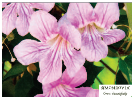
Lavender Trumpet Vine Clytostoma callistegioides

Amazing warm season color display for fences, high walls or arbors. Vigorous grower produces blood red trumpet-shaped flowers with a yellow throat. Climbs by tendrils.