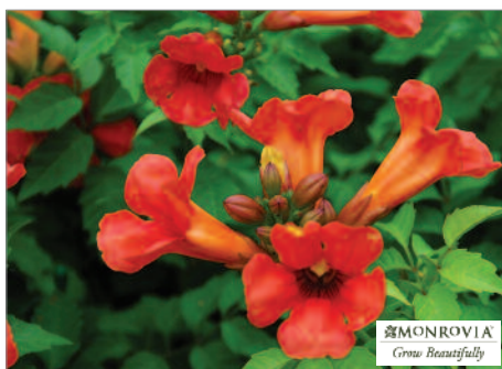
Summer Jazz™ Fire Trumpet Vine Campsis 'Summer Jazz Fire'

At half the size of other varieties, this is a super choice for an easy climbing vine to provide fantastic color and screening without overtaking space. Unique, yellow gold, trumpet-shaped flowers provide great summer color in containers. Grows 3-5' tall & wide.