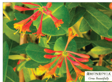
Trumpet Honeysuckle Lonicera sempervirens 'Magnifica'

Features flame-red blooms with intense orange overtones nearly non-stop, summer to fall. Provides fantastic color and screening, without overtaking space (Summer Jazz is half the size of other varieties). Great in containers, easy climber. Grows 3-5' tall & wide.