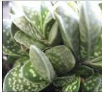
Gasteria Related to aloe, these stemless plants have great colors and spots.