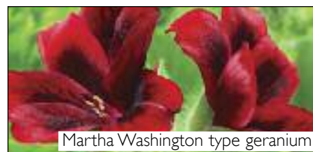
Martha Washington type geranium

There's good reason why the geranium is our number one seller year after year. This herbaceous, clumping perennial is low maintenance, not bothered by insects, and produces beautiful flowers three seasons of the year. Just think of all those big red geraniums decorating the villages in Europe...stunning!