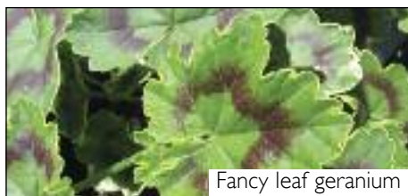
Fancy leaf geranium