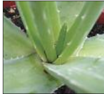
Aloe Showy and easy to grow. Needs only a little water, but can take more. Many varieties.