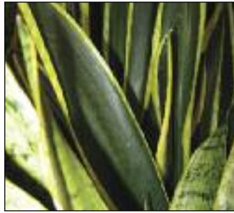
Sansevieria Can handle dry air and fluctuating temperatures.

We call them low-light succulents because they retain their color and do not fade, nor do they become stretched (etioliated), even in the darkest rooms. They will tolerate infrequent watering and are almost immune to pests. Truly versatile succulents!