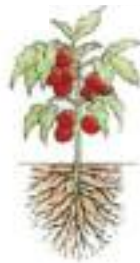
Soil Grown small plant - big roots

The other wonderful thing about hydroponic gardening is that soil-borne diseases and pests are not an issue, and there's no weeding. Whether you want to grow exotic plants that don't flourish locally, or harvest luscious tomatoes in winter, a hydroponic system can be the way to go.