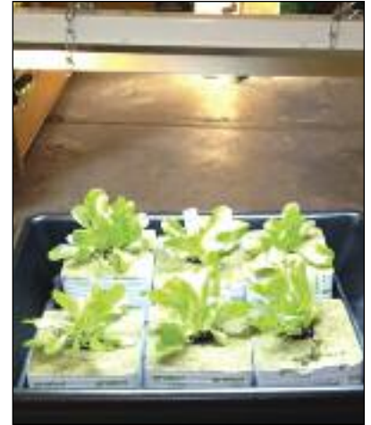
Hydroponic garden at our Danville location. Visit our stores this month to see these hydroponic systems in action.