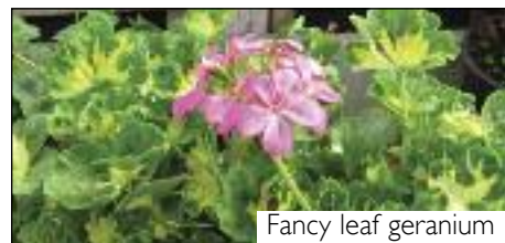
Fancy leaf geranium