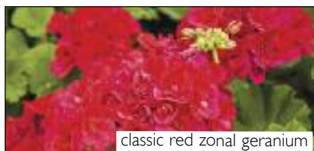
classic red zonal geranium