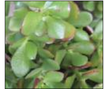
Jade The lovely and ubiquitous jade plant is easy to grow and fun to love.