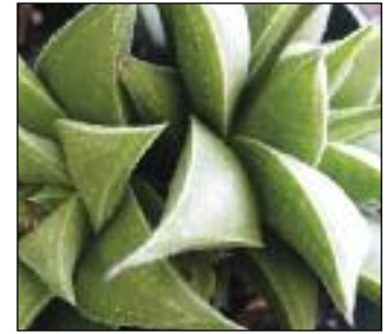
Haworthia There are many types of Haworthia but all are adaptable plants.