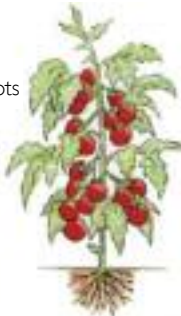
Hydroponically Grown big plant - small roots