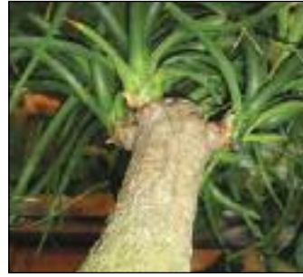
Pony Tail Palm Very slow growing and drought tolerant.