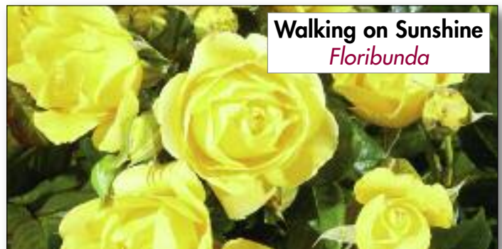
Walking on Sunshine Floribunda

Unparalleled perfume...a sweet licorice and lemon blossom aroma. A bouquet-making machine-of-a-plant with wonderfully formed buds that open into big wavy wonders. Bushy and beautifully branched, it looks as good in the garden as the flowers do in a vase. Large, double, classically formed flowers. Produces more yellow when cool...more white when warm.