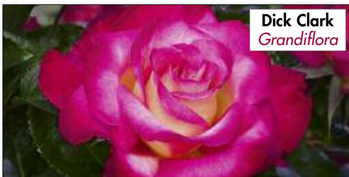
Dick Clark Grandiflora

Tight clusters of bright yellow buds open with an anise aroma. The super glossy, disease-resistant foliage contrasts beautifully with cheery, eye-catching flowers. It's a floribunda with fantastic bloom production and great vigor. Walking on Sunshine is easy to care for and great for beginners.