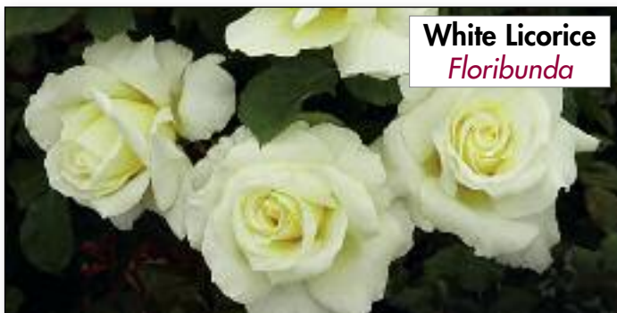
White Licorice Floribunda

This climber has wine purple striped flowers that feature large, pyramid-shaped clusters with bright white accents. Great for any fence, wall or trellis...it repeat blooms readily in the very first year. More stripes show up in cooler weather. Few thorns and moderate sweet apple fragrance. 10 to 14 feet climbing canes with medium-large, large clustered flowers.