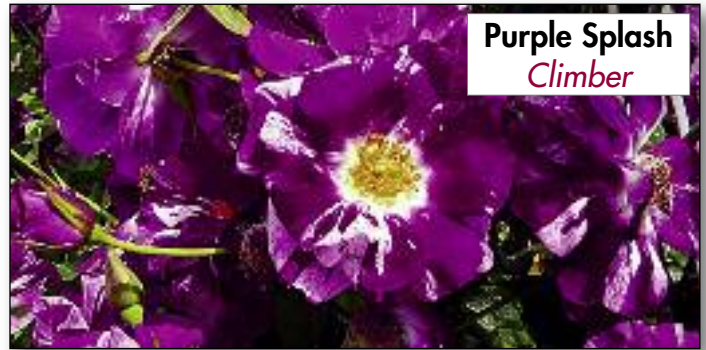
Purple Splash Climber

All-America Rose Selections (AARS) runs the world's most challenging horticultural testing program to recognize roses that are easy to grow and require minimal care. To be chosen as an AARS winner, roses need to thrive during two years of comprehensive testing in 23 gardens nationwide. Look for the AARS red-rose seal when selecting these roses. Available at Sloat Garden Center starting in mid-December.