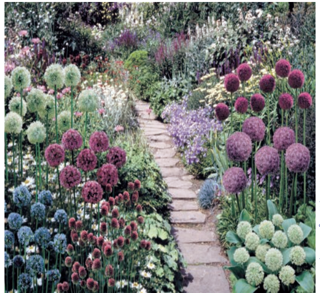
variety of Alliums

A lesser known bulb is the Allium , which is actually an ornamental onion! Showcasing a graceful ball of blooms atop a statuesque stem, these bulbs make an amazing backdrop or border. This year we are featuring a number of allium varieties such as Mount Everest , Giganteum , Globemaster , and Schubertii , many of which are pic-