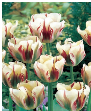
Flaming Spring Green