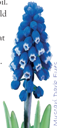
Muscari Dark Eyes

Another fantastic spring bulb is the the Muscari . These hardy and elegant bulbs are ideal for borders and rock gardens and will tolerate some shade and almost any type of soil. Dark Eyes is a unique wild hybrid with bright blue flowers in tight spikes that open to reveal white-rimmed rounded blooms. The unique silvery blue flowers of Valerie Finnis make it the perfect option to set off your heucheras at the edge of the garden. For those of you looking for the traditional royal blue blooms, check out our selection of M. latifolium , Blue Spike , and M. armeniacum .