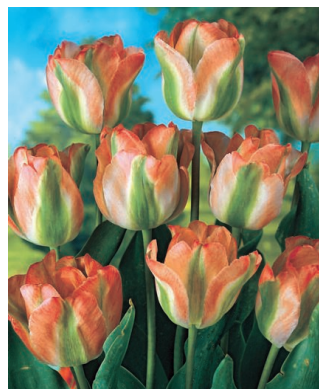
Tulip Orange Greenland