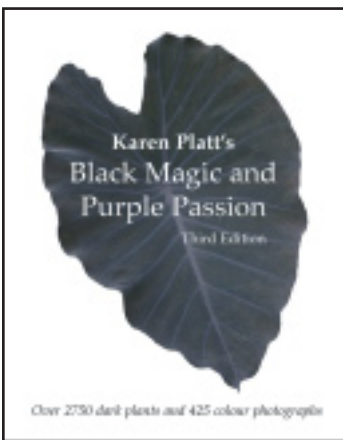
Over 2750 dark plants and 425 colour photographs